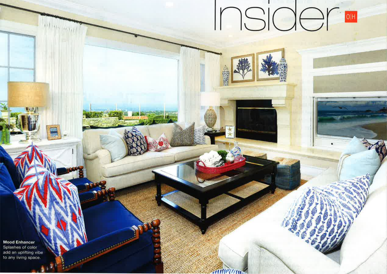
Mood Enhancer Splashes of color add an uplifting vibe to any living space.