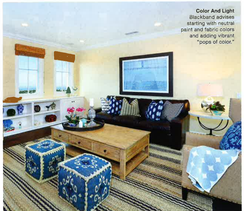
Color And Light Blackband advises starting with neutral paint and fabric colors and adding vibrant "pops of color."

"It's a mix," she says, "and it definitely exemplifies what I do for other people. I love what I do. I feel lucky that I get to live in such a cool place and live along the coast and do what I like to do." OIH